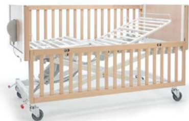
Lowerable bar siderails