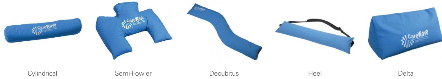
Cylindrical Semi-Fowler Decubitus Heel Delta