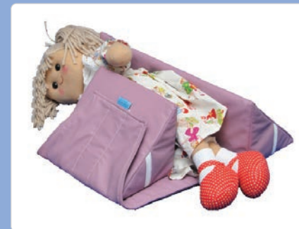
Sidney Side Lyer

For more Paediatric position pillows, visit www.aidacare.com.au to check out the complete Snooooooze range.