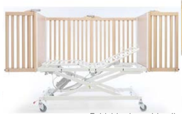
Foldable door siderails