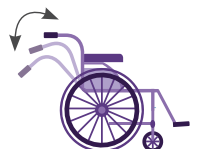
BACKREST ANGLE ADJUSTABLE